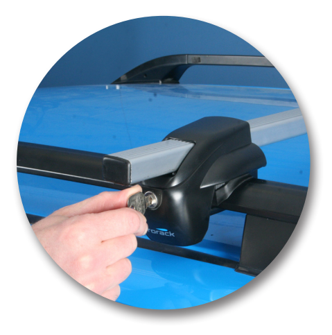
Lock, using the key.

Fully tighten the plastic nut at the front of the leg.