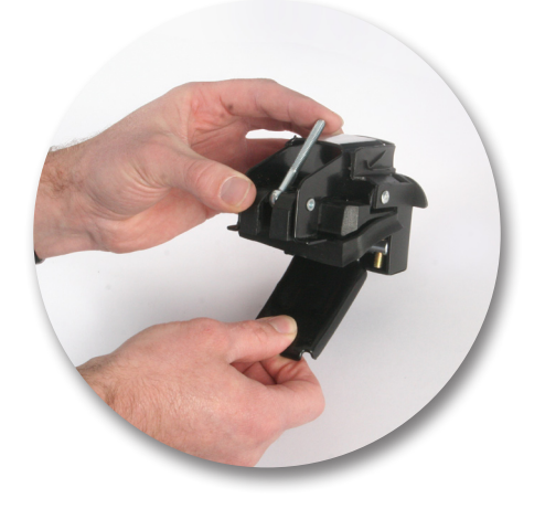
Fit the clamp to the leg.