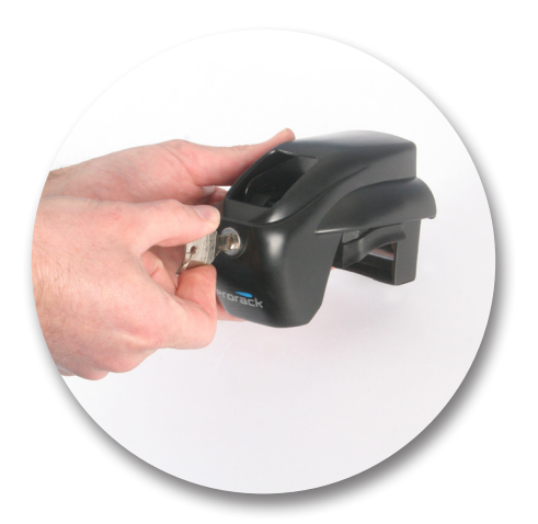
Using a key, unlock and remove the locking covers from the leg assemblies.